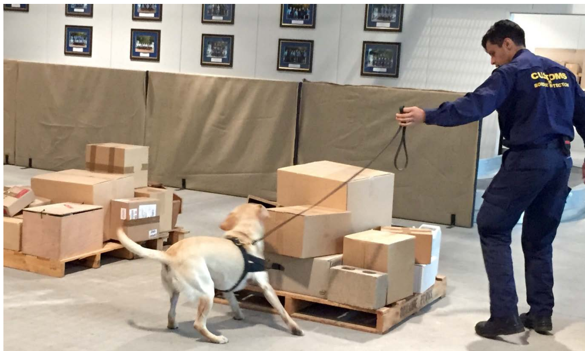
Figure 2.1: Customs' officer and dog searching pallet for explosives as part of a training exercise

1.83 The committee also observed younger dogs honing their natural instincts for searching through exercises conducted with their trainers: