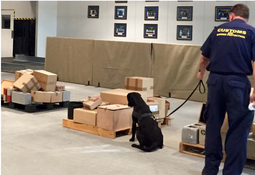
Figure 2.2: Detector dog alerting handler to the presence of explosives in the package as part of a training exercise

1.88 The committee would like to thank the customs officers at the National Detector Dog Program Facility for their time and the knowledge they imparted and commends them on the important role they play in protecting the community.