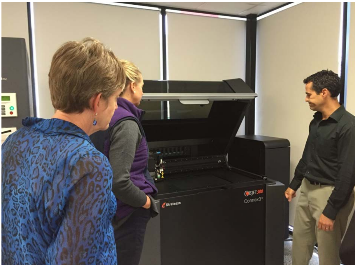
Figure 3.1: Committee members inspect a 3D printer